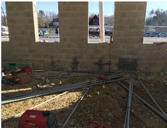
Electrical Conduit Installation at Rail Trail