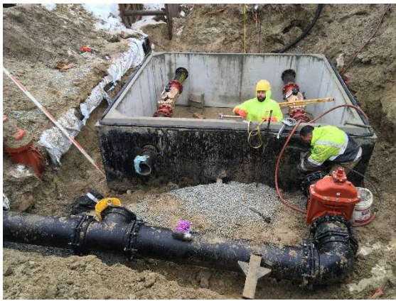
Meter Pit Installation at Northland