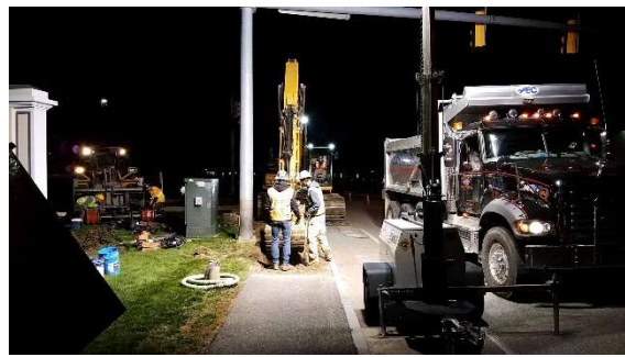
Night work at NH 111 & NH 111A intersection