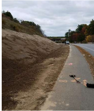
Clean-up along NH Route 111 hillside