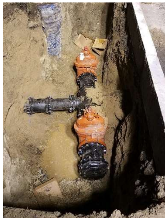
Valve cluster for connection to Pennichuck East Utility Water Main