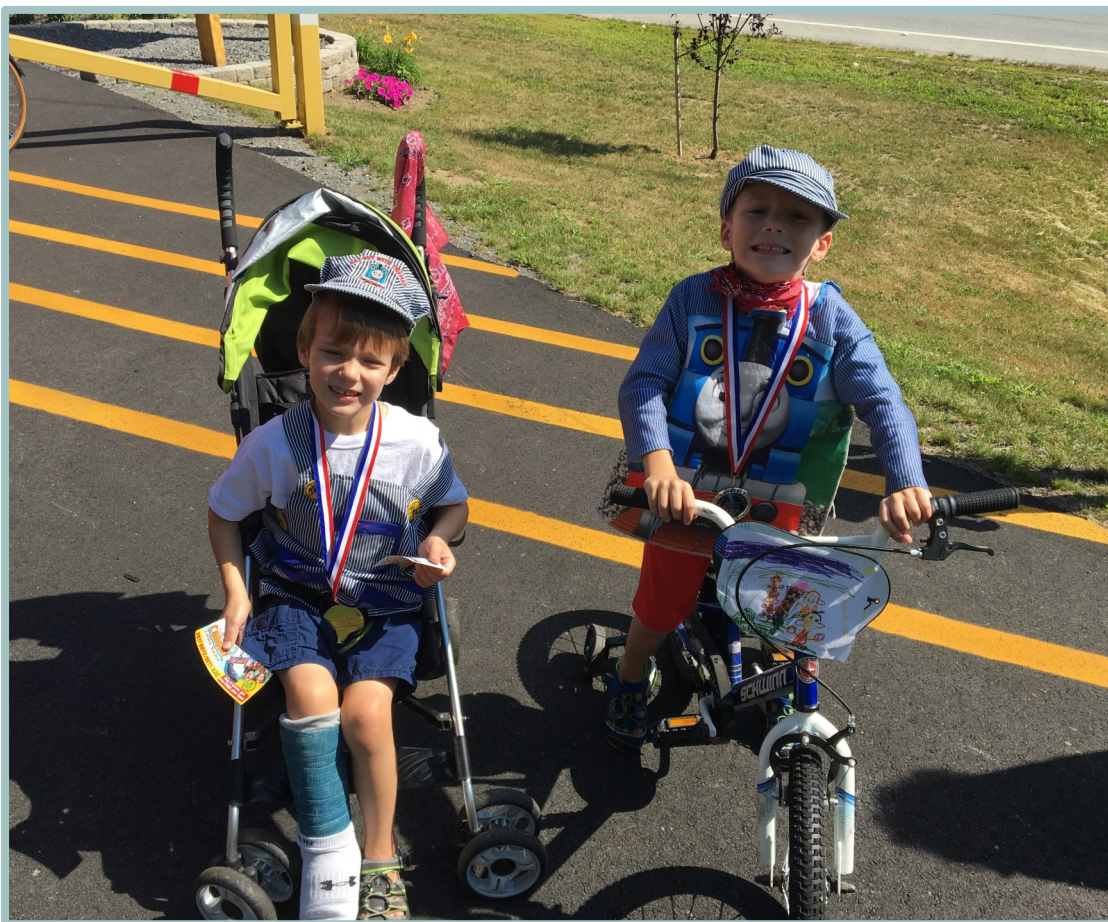
A couple of enthusiastic participants in the “All Aboard!” event on Salem Bike-Ped Corridor