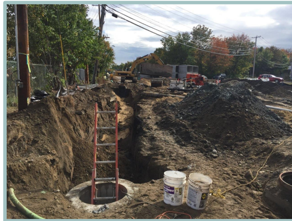
Pleasant Street sewer

Work continues on Meadow Lane and Sylvan Drive, with Carriage Lane to follow in late October. Fall crack sealing operations are underway, starting with Shore Drive. Decorative traffic signal equipment is up and operational at the Post Office intersection on South Broadway. Once the Tuscan Village intersection approach is finished, and fiber optic lines are run, the new signal will be integrated into the Town's coordinated traffic signal system. Pleasant Street will remain closed for culvert replacement into November, due to unanticipated permitting delays and construction complications. However, construction has progressed with water relocation around the culvert, installation of new sewer (in a steel sleeve) under the new box, and setting of box sections.