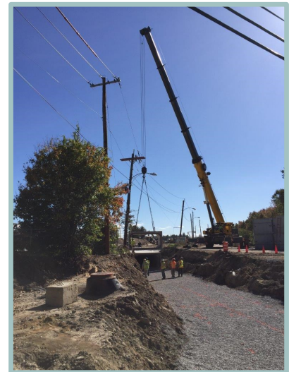
Pleasant Street box culvert