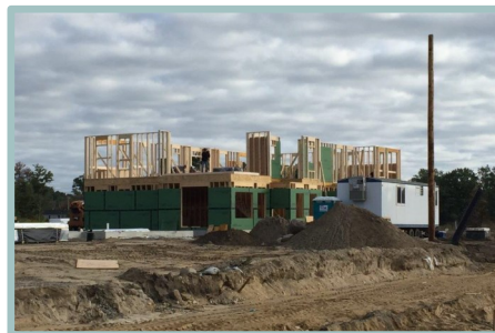
Tuscan townhomes construction