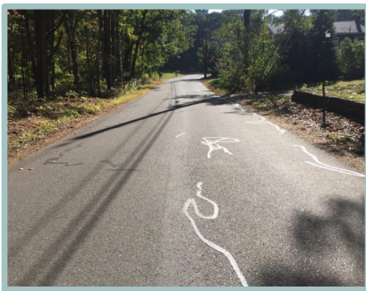
Shore Drive crack sealing