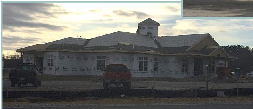
Luxury apartments clubhouse