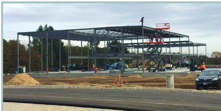
Setting steel for Ford Dealership