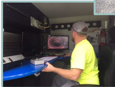
CCTV of sewer mains