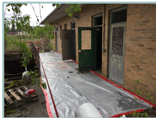
Abatement of hazardous material at the main building of the former wastewater treatment facility

Road construction is underway with drainage work occurring on Bradford Drive and Haverhill Road. Bradford will be reclaimed and paved and then crews will move to Woodland Avenue. Look for updates on Engineering's webpage and Twitter feed ( @SalemNHEngDiv ). Demolition work continues at the former Wastewater Treatment Facility on SARL Drive. Hazardous materials are being removed from the Main Building prior to its demolition. Site construction is active throughout town, including at Tuscan Village where sites for the apartments and townhomes are being cleared, dewatered, and prepped for installation of building foundations. Work at the Post Office intersection on South Broadway will be starting soon, beginning with drainage installation on the west side of the roadway.