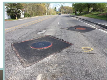
New cover and shimmed cover waiting for pavement

We received 1.98" of rain so far this May. Canobie Lake has risen to 219.96' approaching full capacity (220.00'). We are producing an average of 1.9 MGD of Finish Water for the month of May which is average for the month. 16 manholes covers have been recently adjusted or replaced on North Broadway. Work involves saw cutting and excavating around each cover, adjusting its elevation by replacing the supporting brick and mortar, shimming and compacting the subgrade around the structure, and installing a pavement patch. Patches are left low for 1-2 weeks to allow traffic to further compact it so that any settling is finished, then a final top coat of pavement is applied. These improvements help seal and preserve the manhole and provide a smoother ride for the traveling public. Closed Circuit Television (CCTV) inspection of sewer mains is underway to identify locations of Infiltration and Inflow (I/I). Approximately 60% of average annual sewer flow is attributed to I/I, which is mostly clean water. Reducing I/I through repairs and disconnection of inflow sources reduces flows, thereby saving on treatment costs and preserving system capacity.