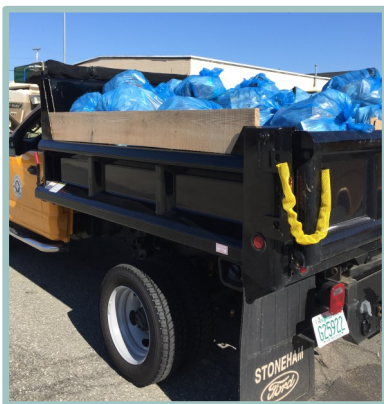
A truckload of litter collected by Public Works

Winter season totals are in; we responded to 44 operations of Primary Salt routes and 15 operations of Secondary Salt Routes, along with 13 plow operations battling 86" of snow accumulation. Our first operation of the season was on December 5th with a general salting and our first plowable event was on December 12th for a 3" snow event. We ended the season with a 6" snow storm on April 1st. We used 8617.3 tons of salt, 519.75 tons of sand and 19,500 gallons of liquid calcium to combat snow alongside our contracted plowing. Litter pick up in April totaled 2.8 tons, which is down from previous years in part due to reduced available manpower. Public Works has been busy recently with street sweeping, lawn repairs, mailbox post replacements (now that the ground is thawed), loaming and seeding of graves from winter burials, spring landscaping, and mowing. Seven light fixtures were replaced at the Public Works facility to improve lighting and save electricity.