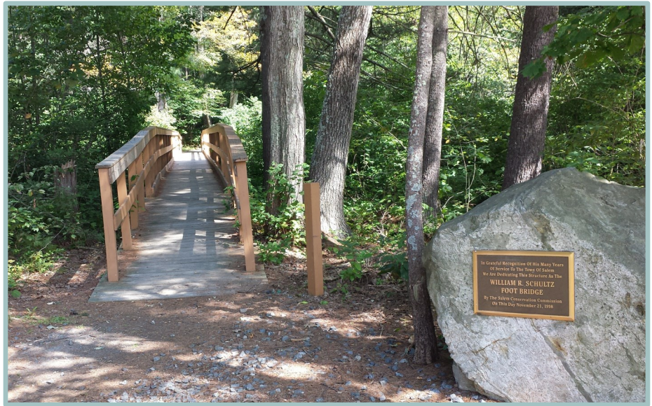
Salem Town Forest

A consultant working for the Conservation Commission just completed a draft Town Forest Management Plan. The Plan includes information on natural resources, forest types, and recommendations for wildlife, recreation, and education. The Plan is available on the Conservation Commission's web site .