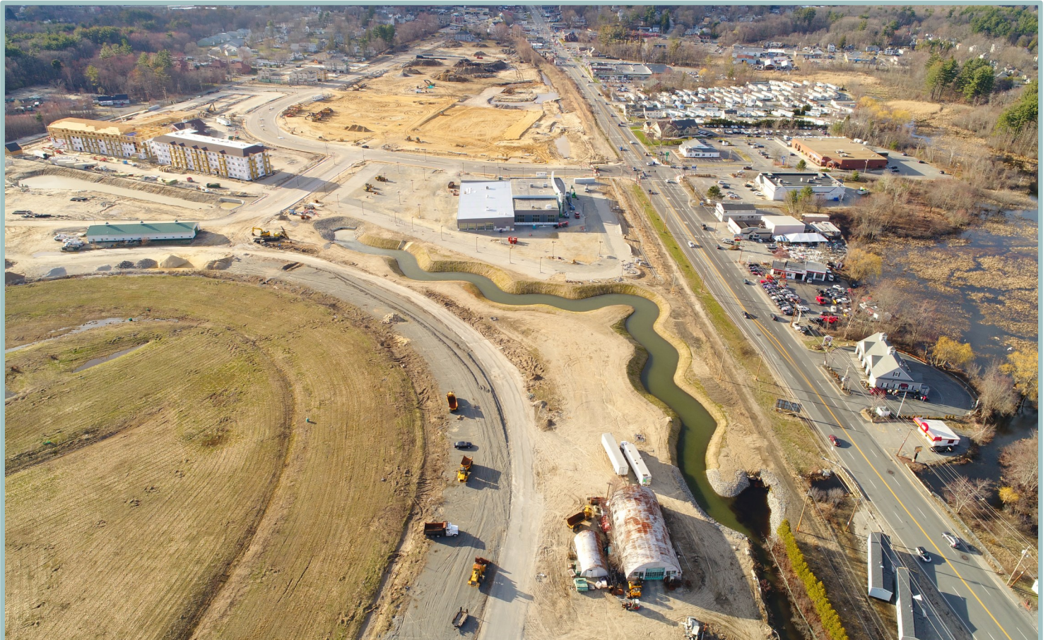
Floodplain Improvements (bottom), Ford Dealership (center), Retail Development (top), Apartments (left), and Villas (top left)