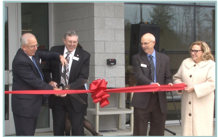
Ribbon cutting at Salem High School

After a brief overview in the Performing Arts Center the community had guided tours throughout the entire school. Salem Community TV and the school's media center showed everyone the studio and control room and even had some fun free play with the virtual reality sets. This can be viewed on SCTV 17 with this link .