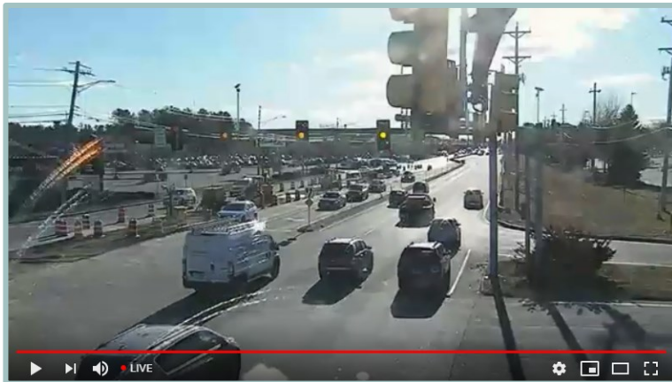
View of traffic at Rockingham Park Boulevard