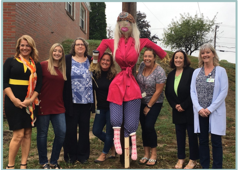
The Finance Department enthusiastically participated in the town-wide scarecrow contest!