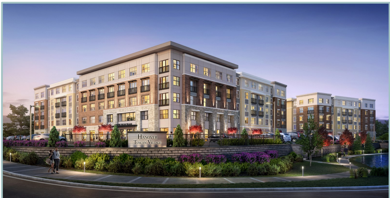
This is the latest rendering of the Hanover Tuscan Village apartment project (281 units) which is currently under construction