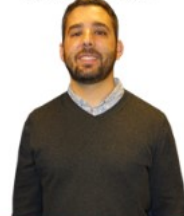
CANDIDATES FOR PLANNING BOARD