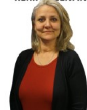
CANDIDATES FOR TAX COLLECTOR