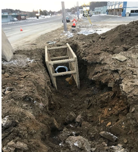
Water Main Trench for Pipe Installation