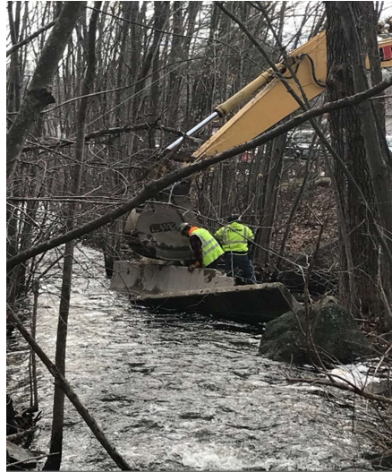
Stream Diversion for Work at Culvert Crossing