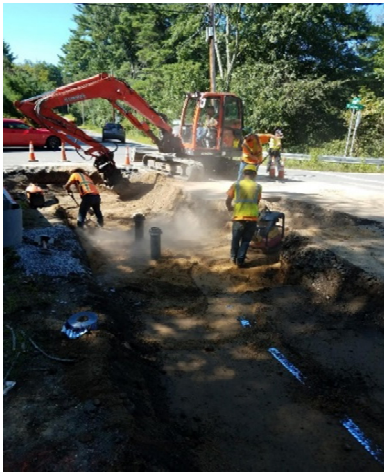
Westside Drive/Shannon Road Work