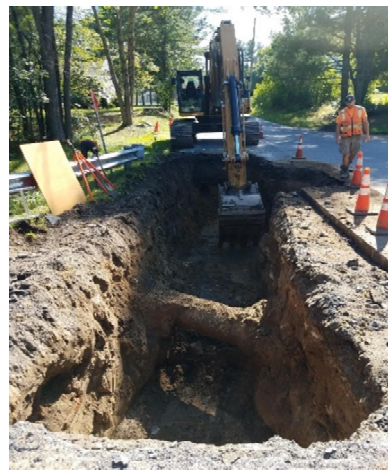
Trench Excavation for Pipe Installation