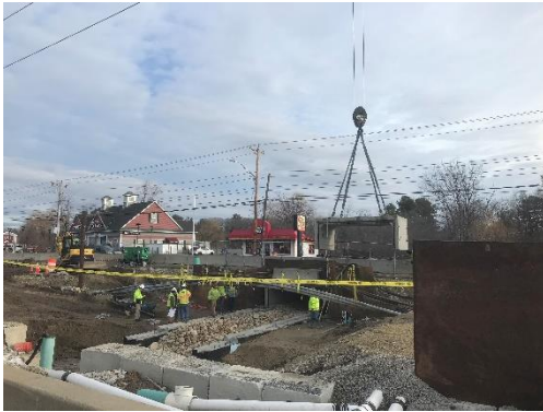
Bridge Section Installation