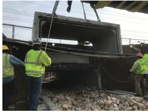
Bridge Section Installation