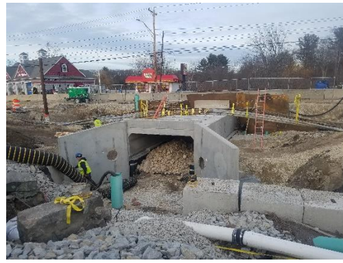
Bridge Deck with Wingwalls Installed