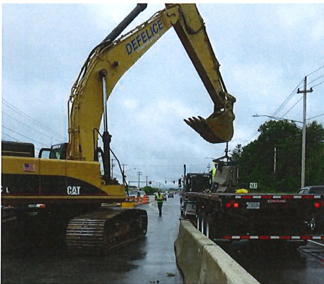
Work Zone Barrier Setting