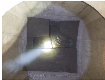
Special Sewer structure installation