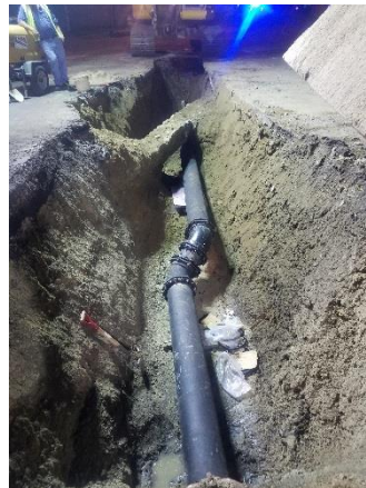
Water main installation on Main Street