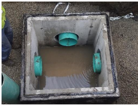
Special Sewer Structure