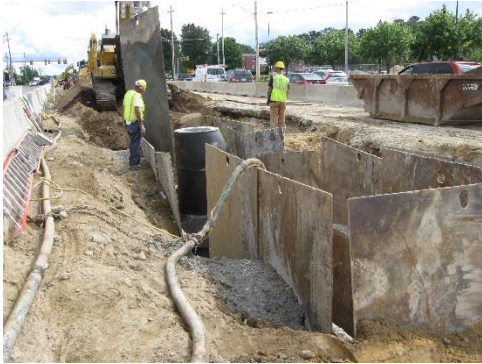
Sewer Trench Installation