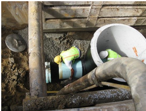
New Sewer Manhole