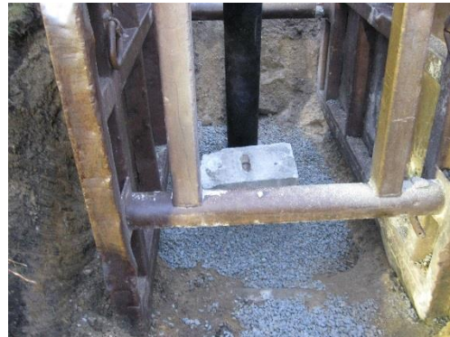
New Water Main Installation