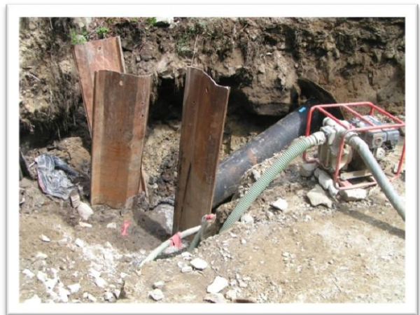
Waterline at third fitting