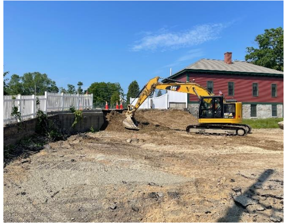
Rough grading the new slope after the removal of the retaining wall.