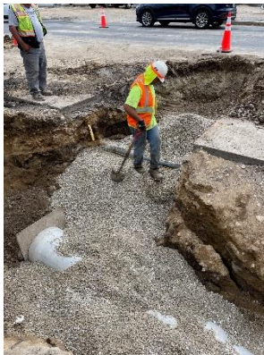
Backfilling the trench after adjusting the sewer service at Dunkin Donuts.