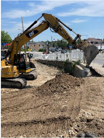
Demolition of the existing retaining wall along the west leg of Main Street.