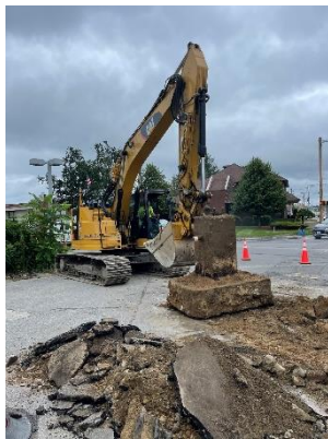
Contractor removing the foundation of the old traffic signal mast arm.