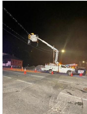
Electricians installing temporary traffic signal heads.