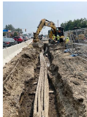
Prime and utility contractors working together to relocate an existing duct bank to allow for a new drainage crossing.