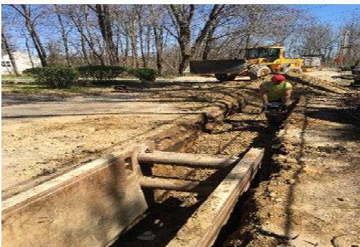
Lake Shore Road Sewer Main Installation