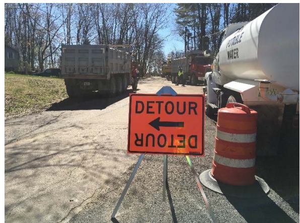
Temporary Detour, and Traffic Maintenance, assisted with Town Officers