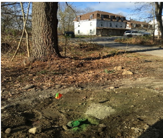
Sewer Service installed at green stake