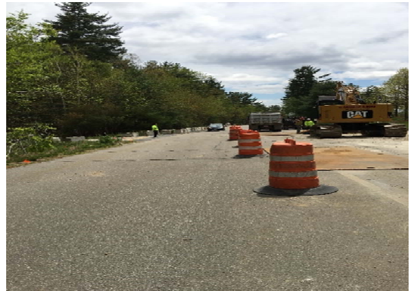
Preliminary Work for North East BLVD.