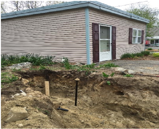
Sewer Service installed at Home