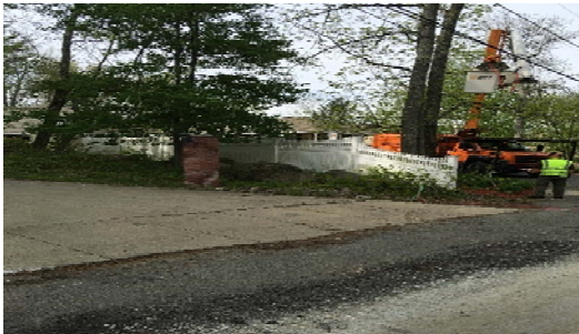
Final Tree Removal to occur on South Shore Road