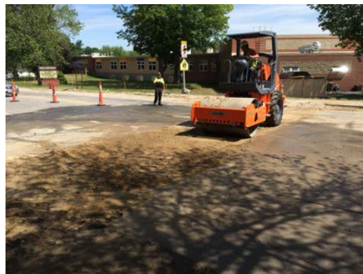
Drainage Work along Main St