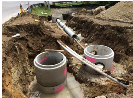
Drainage along Northeastern Boulevard