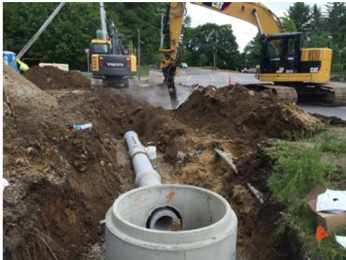
Drainage along Northeastern Boulevard