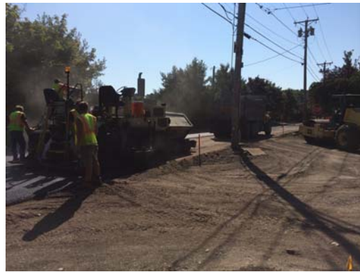
8/26/2014 – Base Course Paving South of Route 38