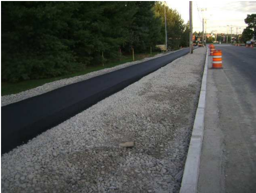
7/21/2010 – Sidewalk Construction Near Target