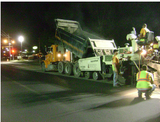
7/30/2010 – Top Course Paving Between Route 28 and Target/BJ's