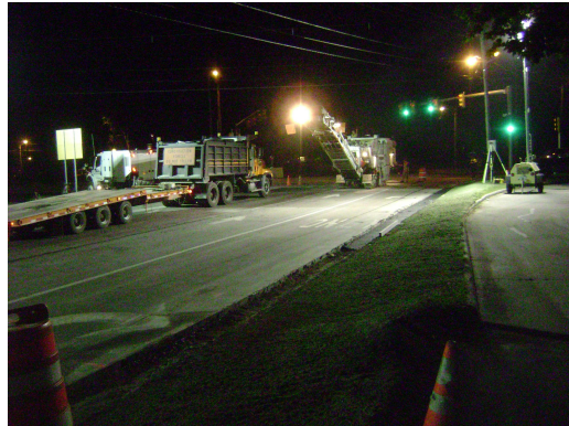
7/29/2010 – Pavement Milling Near Route 28